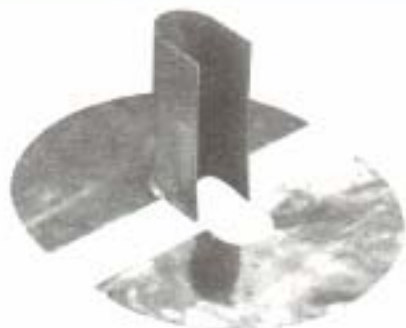
SPLIT FLASHING 1 OR 2 PIECES