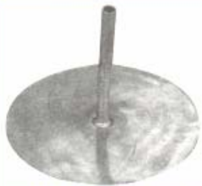
STANDARD FLASHING SQ. OR ROUND BASE SQ. OR ROUND RISER