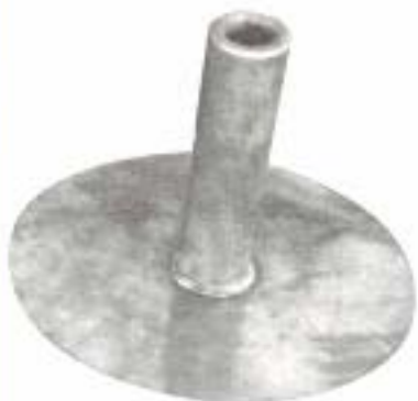
FLASHING W/ COUNTER FLASHING